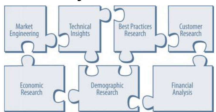
Chart 6: Benchmarking Performance with TEAM Research

evaluation platform for benchmarking industry players and for creating high-potential growth strategies for our clients.