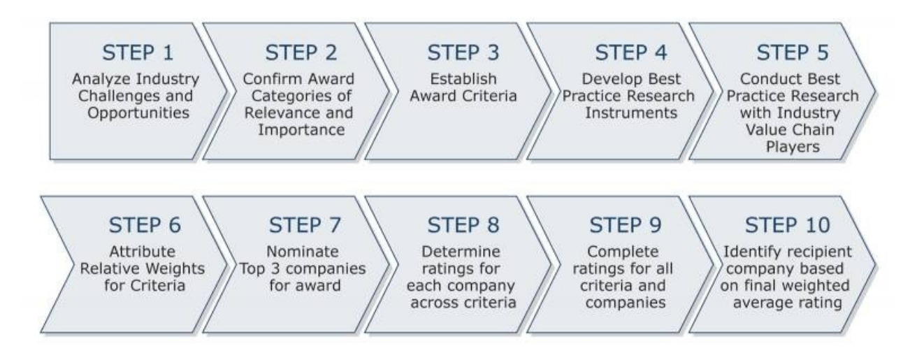
Chart 3: Frost & Sullivan's 10-Step Process for Identifying Award Recipients

This exercise encompasses all criteria, leading to a weighted average ranking of each company. Researchers can then easily identify the company with the highest ranking. As a final step, the research team confirms the veracity of the model by ensuring that small changes to the ratings for a specific criterion do not lead to a significant change in the overall relative rankings of the companies.